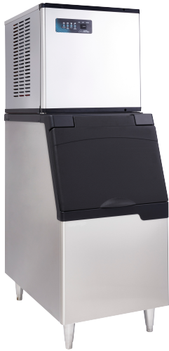
ICETRO IM-0460-22 ice machine on a IB-026-22 bin