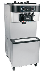
Taylor C716 Twin twist, heat-treatment soft serve machine for high-volume operations