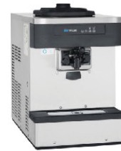
Taylor C152 Compact single-flavor soft serve machine