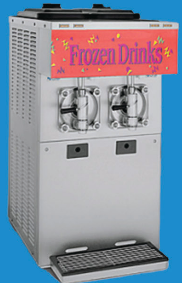
Taylor 432 Multi-flavor frozen drink machine for expanded menu options