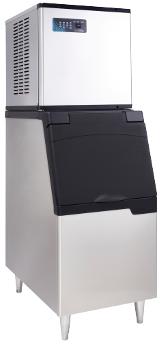
ICETRO IM-0350-22 ice machine on a IB-026-22 bin