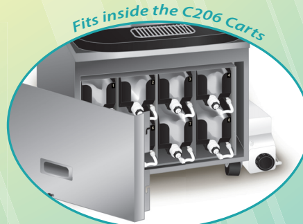
Fits inside the C206 Carts