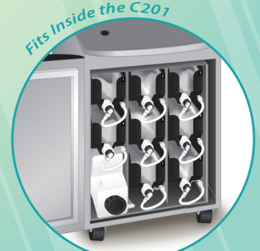
Fits Inside the C201