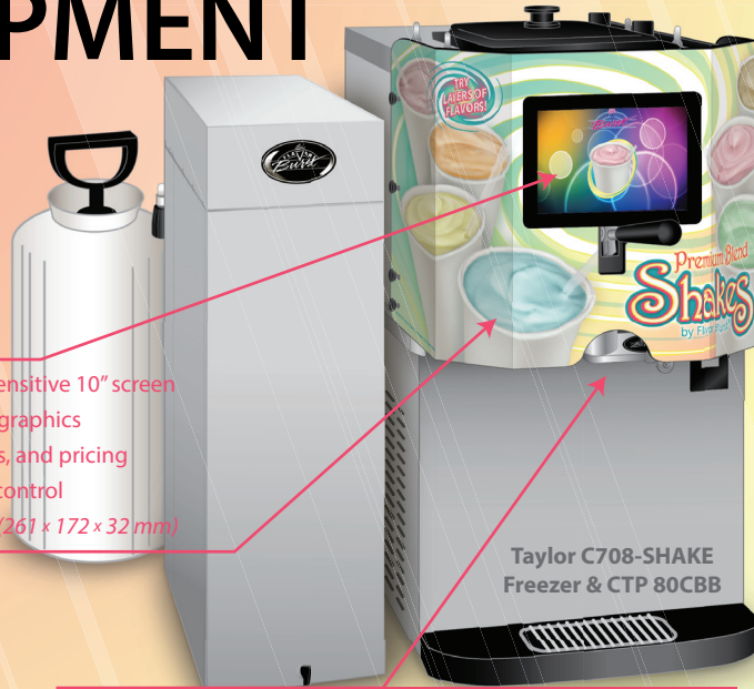
Taylor C708-SHAKE Freezer & CTP 80CBB