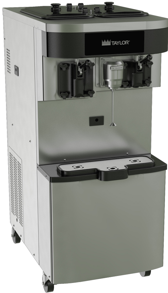
Shown with Optional Panel Spinner

Front casters have a locking feature for operators to keep equipment in place. The lock can be released to move the equipment for cleaning.