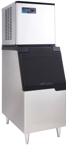
ICETRO IM-0550-22 ice machine on a IB-026-22 bin